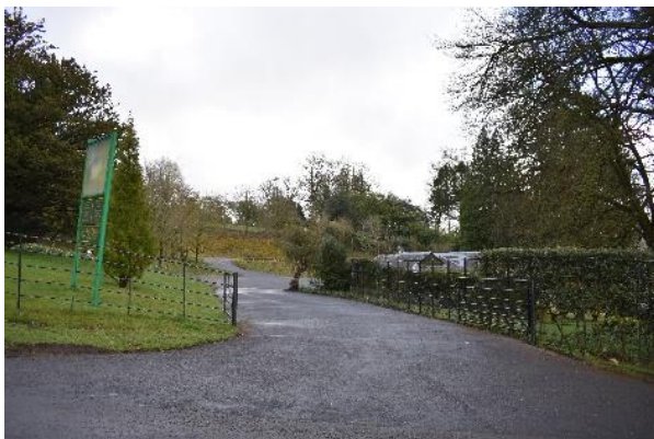
Entrance from the road to the car park