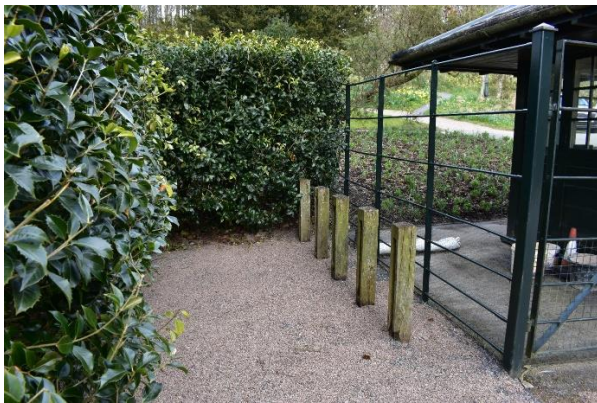
Bicycle racks provided behind the wooden hut at the entrance to the Gardens