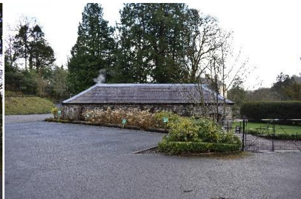
Main car park showing disabled parking bays and entrance to the Gardens