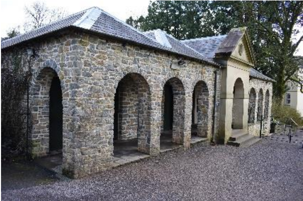
Ramped entrance to the shop and steps, toilets left